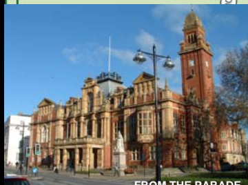
FROM THE PARADE