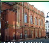
FROM LIVERY STREET