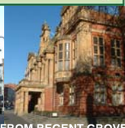
FROM REGENT GROVE