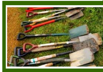
From Fit4funding newsletter

Website: http://www.treecouncil.org.uk/?q=grants