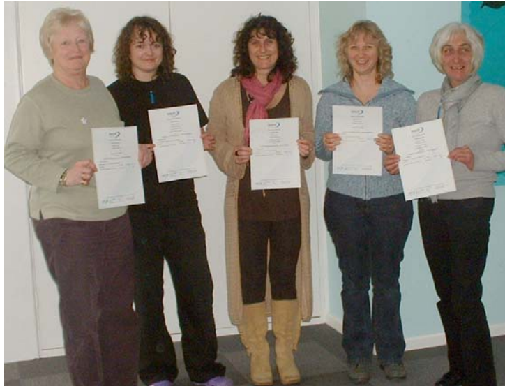
Bridge Action Group!