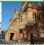
FROM REGENT GROVE