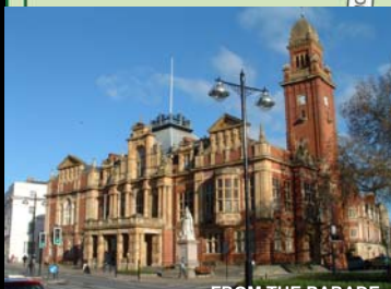
FROM THE PARADE